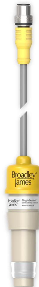
SU400-16-M1 Single-Use Conductivity Sensor