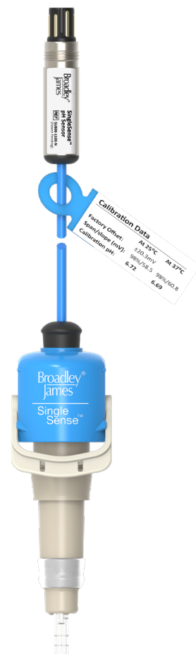
SU800-16-V8 Single-Use pH Sensor