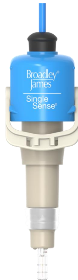
SU800-16-V8 Single-Use pH Sensor