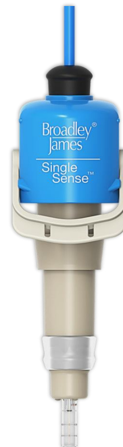
SU800-16 Single-Use pH Sensor