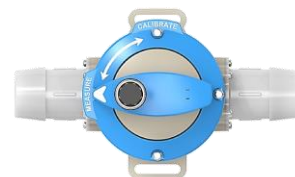
Top View with Dial Face