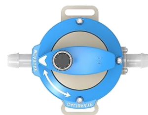
Top View with Dial Face