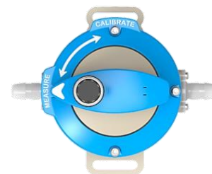
Top View with Dial Face