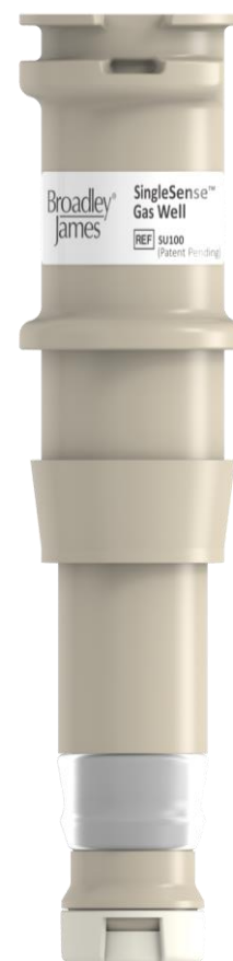
SU100-16 Single-Use Gas Well