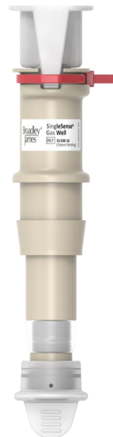
SU100-16 Single-Use Gas Well