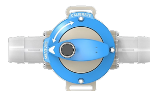
Top View with Dial Face