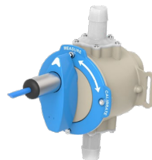
Sensor in Measure Mode

PEEK, USP Class VI, ADI-Free Extraction Tested 21CFR, 177.2600, Dimethyl Silicone Rubber, Pt Cure, USP Class VI Extraction Tested 21CFR, 177.2600, EPDM USP Class VI, FDA Compliant, ADI-Free Lead-free Glass, Alumina Silicate